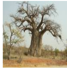
The sacred baobab tree.

The Gambia, is a nation of about 1.5 million people situated on the West Coast of Africa and is the ancestral home of Kunta Kinte of Roots fame. The center of the slave trade during the 17th and 18th centuries, this very peaceful former British colony, with its beautiful beaches now boasts tourism as its main industry.